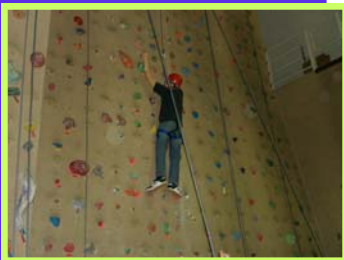
H.O.P.E. at the rock climbing wall — Finch Field House